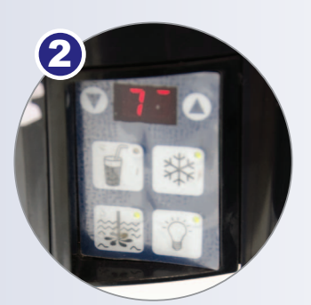
Adjustable Slush Mode